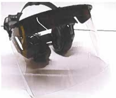
XM4 Visor + Bow Guard

Silenta logo and XM4 product ID are marked on visor carrier. XM4 product ID is marked also to the visor. Batch number/manufacturing date are marked to visor carrier.