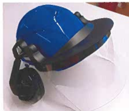
XM4 Visor + SIL MC Carrier

(5) The article identified in (4) above is in conformance with the relevant Union Harmonisation Legislation Regulation (EU) 2016/425 and Directive 2001/95/EG.